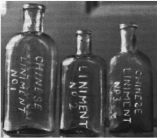
Three aqua pontiled Coffeen bottles: (all circa 1847-52) The largest is embossed "CHINESE / LINIMENT / NO. 1 // PRICE 50 CTS", the second "COFFEEN'S // LINIMENT // NO. 2, the third is embossed "COFFEEN'S // CHINESE (backwards "S") / LINIMENT / NO. 3. Nowhere in his newspaper advertising does he refer to these different products.

assurance that unlimited amounts can be readily sold. Hundred of letters are coming to hand ordering supplies which contain unsolicited, the most flattering representations of its wonderful efficacy.... It needs no the stereotypebullitions of the hired puffer to herald it to the world.... Having won by its merits an imperishable fame far above the narrow minded, petty slanderer, and out of the reach of the Counterfeiter and Unprincipled Impostor to imitate successfully.