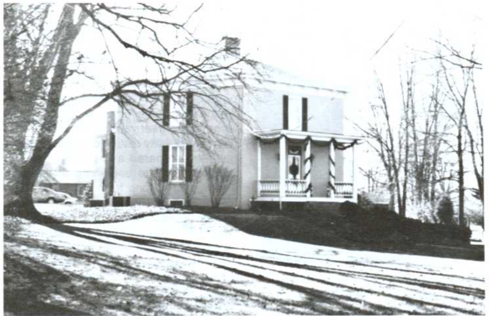
The "Coffeen House" located at the edge of Lebanon, Ohio is one of only a few octagonal houses in this part of the state. A long since torn down "office" was located next door. The Cistern of the office was filled with hundreds of broken pontil age Coffeen Liniments.