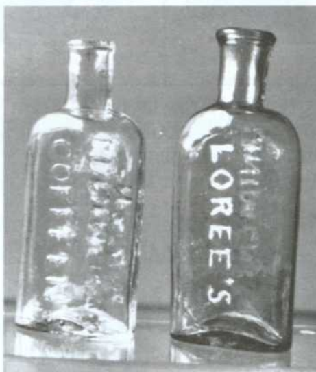
The Two Challengers