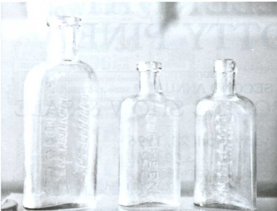
Three aqua smooth based, hinge mold Coffeen bottles: (all circa 1860-1870) the large size is embossed "CHINESE / LINIMENT / NO. 1 // PRICE 50 CTS." The other two are identical except for their lip treatment say "COFFEEN'S // LINIMENT."

900 GROSS of this liniment now ready for the market- Those who wish to deal in this commodity, and at the same time to confer a blessing upon the mankind, can make investments in either large or small amounts in a manner perfectly safe, and derive large profits upon their capital. The putting up of a large amount of this Liniment at a time enables me to put it up much cheaper than it can be done in